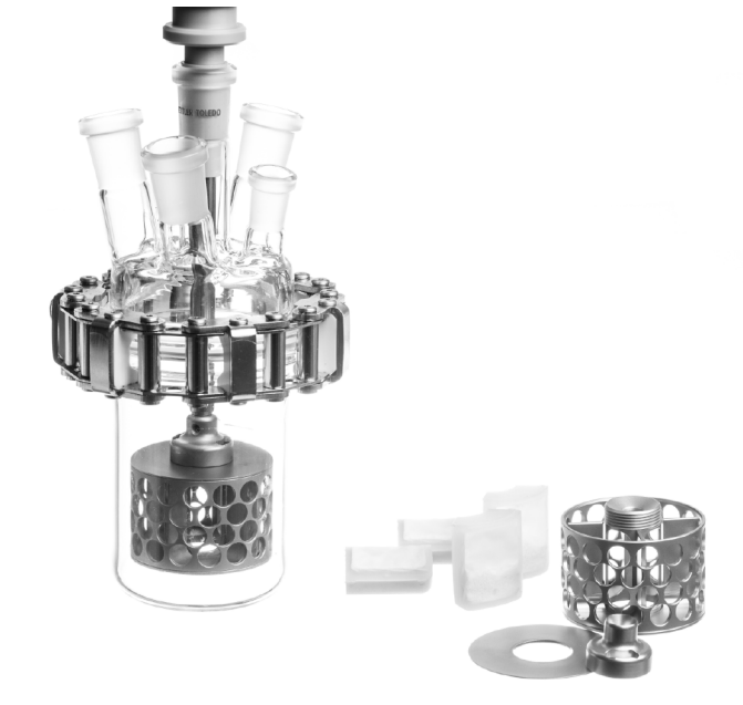
Figure 1. EasyMax<sup>™</sup> 102 Advanced glass vessel with SpinChem<sup>®</sup> RBR S2 and prepacked cartridges with immobilized lipases.

The SpinChem® RBR design improves catalyst stability and eliminates filtration steps by keeping the immobilized enzyme