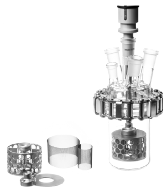
SpinChem® RBR S2 in an Advanced glass vessel

Recycling of immobilized enzymes catalysing the esterification was successfully performed using a SpinChem® RBR S2 fitted into the EasyMax™ 102 Advanced synthesis workstation. The process proved very time efficient as no filtration steps were needed between cycles, or for the samples extracted for analysis during each run. Washing of the resin between runs was fast, simple and robust, without running the risk of material loss. The easy work-up achieved with the RBR means higher productivity, especially for high reaction rates. This, together with the stable reaction environment of the workstation, ensures a streamlined workflow with high experimental reproducibility, and the possibility of automation.