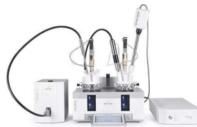
Process Analytical Technology EasyMax integrate seamlessly with real-time in situ probes