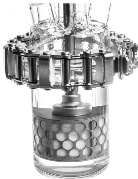
Figure 1. EasyMax™ 102 Advanced glass vessel with SpinChem® rotating bed reactor (RBR) S2.

The SpinChem® rotating bed reactor (RBR) is a device designed for heterogeneous reactions. The solid phase is kept contained as a packed bed within a rotating cylinder, through which the liquid phase is repeatedly percolated. The very efficient mass transfer achieved, together with no filtrating steps or particle grinding, allows for quick, easy and reproducible reactions. In this application note, the esterification of 2-Ethyl-1-hexanol into 2-Ethylhexyl acetate was performed, catalysed by immobilized CalB (Novozyme 435). The enzyme resin was packed into a SpinChem® RBR S2 twice, and each time used for seven consecutive reaction runs in an EasyMax™ 102 Advanced synthesis workstation.