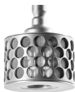
SpinChem® S2 RBR Efficient rotating bed reactor for 100-500 mL reaction vessels