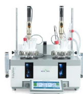
EasyMax™ 102 Advanced Robust synthesis workstation for high R&D productivity